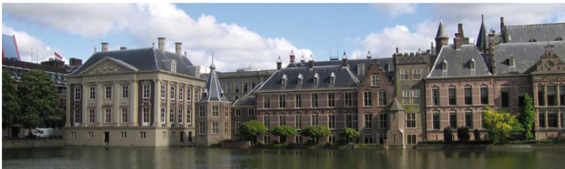
Figure 2: Dutch government buildings

As for the local communication process in Barendrecht, the NearCO 2 project has delivered a case study for the project period until November 2009 in more detail. You will find this report published on the NearCO 2 website www.communicationnearco2.eu . (See the report "Review of the public practices for CCS and non-CCS projects in Europe" in appendix G. On the base of the case study a conference paper has been published as well).